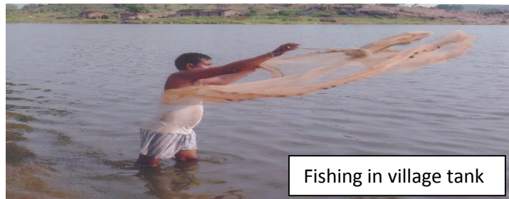
Fishing in village tank

The local fishermen stock the 23.66 crore fish seed in their ponds and average of 4735 mt per annum fish was produced, which enabled beneficiaries to earn an average of Income of Rs. 47.35 crores per year.