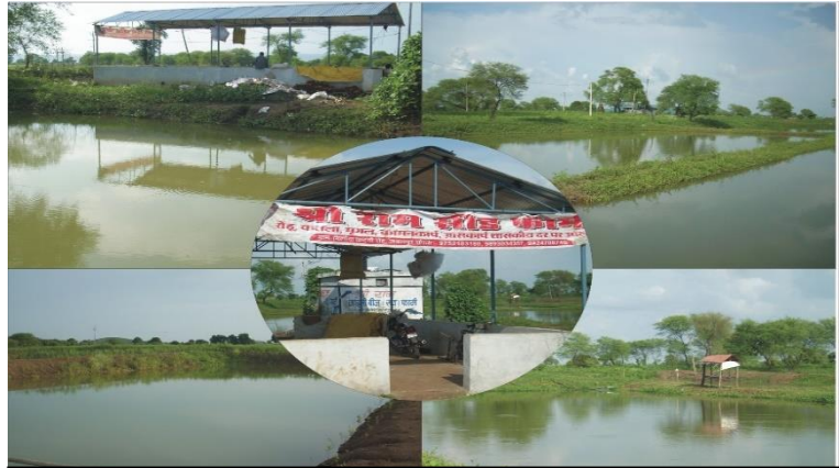
Construction of Rearing ponds and Packing shed under RKVY, Village Milauda, Katangi Road, Distt Jabalpur M.P.

Under the project, during the year 2010-11, 2012-13, 2013-14 and 2014-15, 182.40 hectares of fish seed rearing area was constructed by the fishermen beneficiaries with a total cost of Rs. ....crores and the beneficiaries were directly benefited from the work of fish seed production.