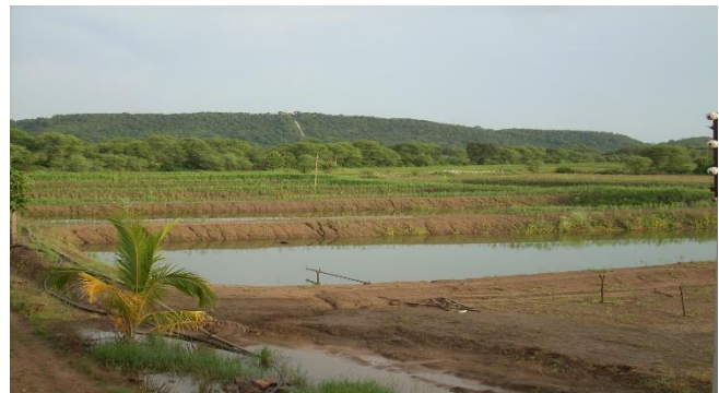
Rearing Pond, Village Gwari, Block Patan, Distt Jabalpur

In the year 2009-10, only 47.91 crores of standard fry fish seed could be produced against the requirement of 63 crores of standard fry fish seed i.e. there was a shortfall of 15.09 crores of standard fry. Due to the increasing popularity of fisheries in the State, requirement of fish seed increased to 97.63 crores standard fry by the year 2014-15.